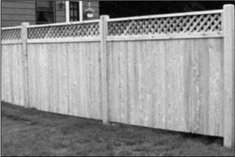
Figure 2c: Six foot privacy fence, vertical board with one foot of lattice.