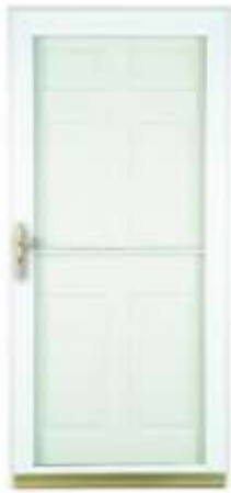
Figure 1a: Centered Cross Bar