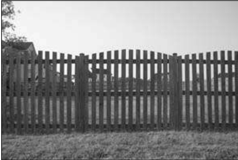
Figure 2a: Four foot picket fence with arched (convex) top.

The allowed wooden fences/composite material fences are illustrated below: