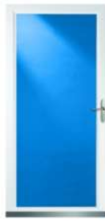
Figure 1b: Full view

Application Process: An application is not required for the installation of a storm door as long as it meets the above criteria. Any storm door that deviates from the above criteria must be submitted to the ARB for approval. In addition to the basic application requirements, applications shall include: