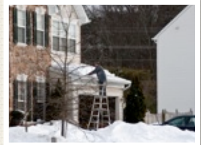
SO MUCH SNOW...