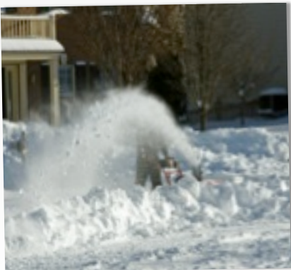
NEIGHBORS HELPING NEIGHBORS