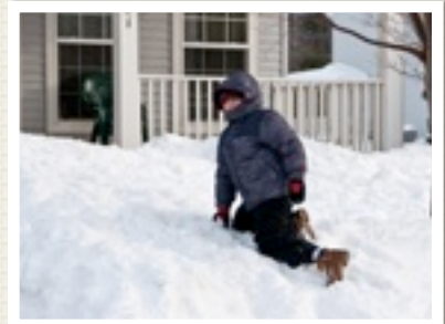
CLIMBING MT EVEREST