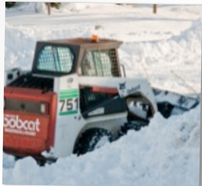
VDOT TO THE RESCUE